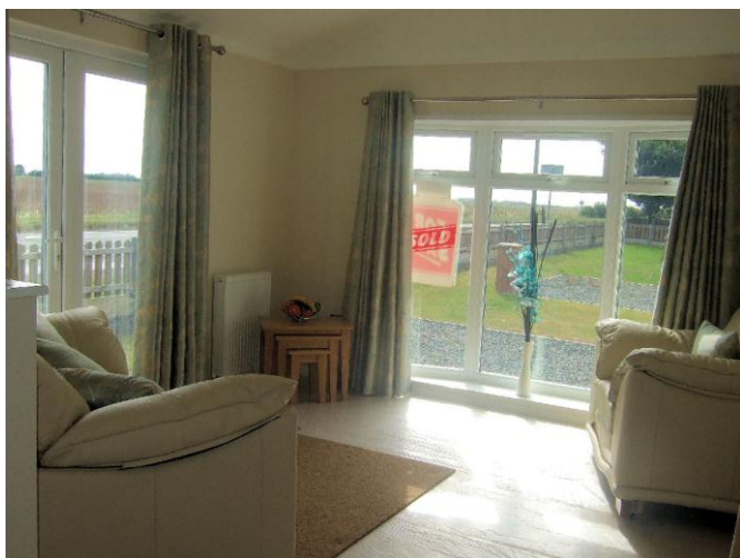
Lounge Front Window