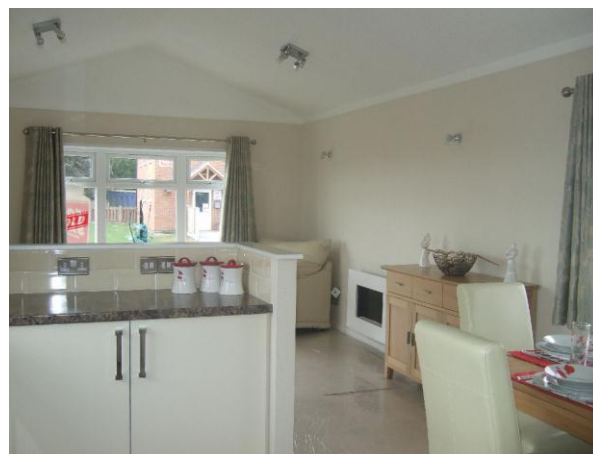
Lounge Patio Doors